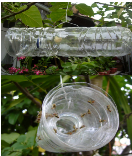
Fig. 1. Types of fruit fly trap applied in this study

sterilized water, while trap-2 cotton was inserted containing 1.5 ml NEO, and into trap-3 cotton was inserted containing 1.5 ml Petrogenol. Each trap was hung on the part of the plant about 2 to 3 meters above the soil surface. The distance of the inter-treatment trap (trap-1, trap-2, and trap-3) was about 40 m to 50 m, while the distance of inter replication traps was about three km. The observation of fruit flies-captured by the traps was conducted every day (24 hours after treatment).